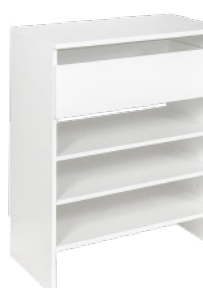
BASE, TOP 1 DRAWER, SHELF