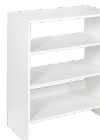
BASE, TOP SHELF