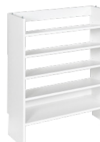
BASE SHOE SHELF