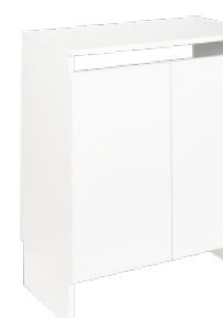
BASE, TOP, DOOR, SHELF