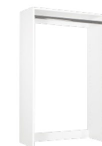
UPPER HIGH HANG