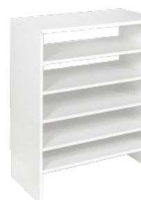
BASE, TOP, SHOE SHELF