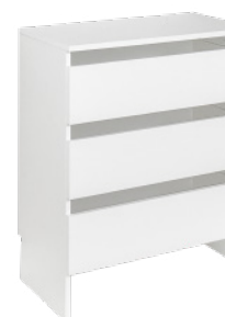
BASE, TOP, 3 DRAWER